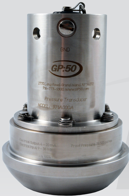
Model 271 / 371 WECO® "Hammer" Union Temperature Transducer