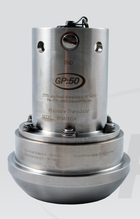
Model 271 / 371 WECO® "Hammer" Union Temperature Transducer